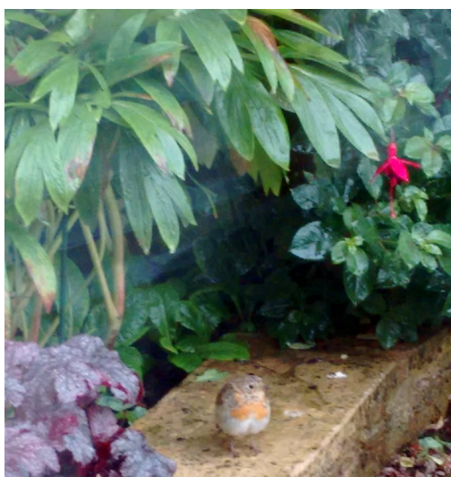
"Sheltering from the rain", Sept 2015

Send your photo to: merriottmessenger@gmail.com